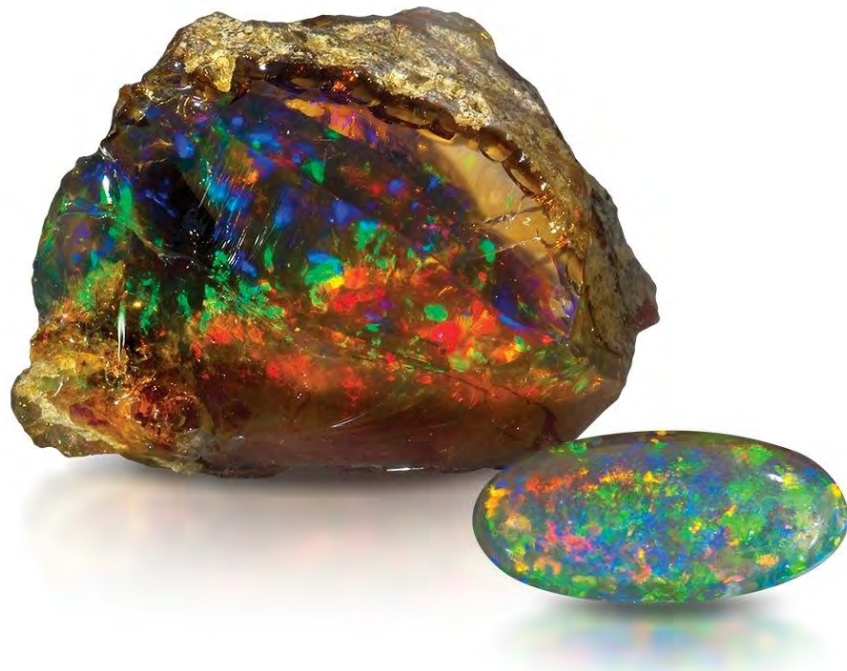
Rough and polished opal.

See "Class Schedules and Classroom Hours" on page 12