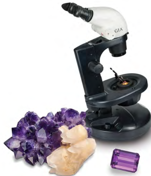
GIA microscope; rough and polished amethyst

See "Class Schedules and Classroom Hours" on page 12.