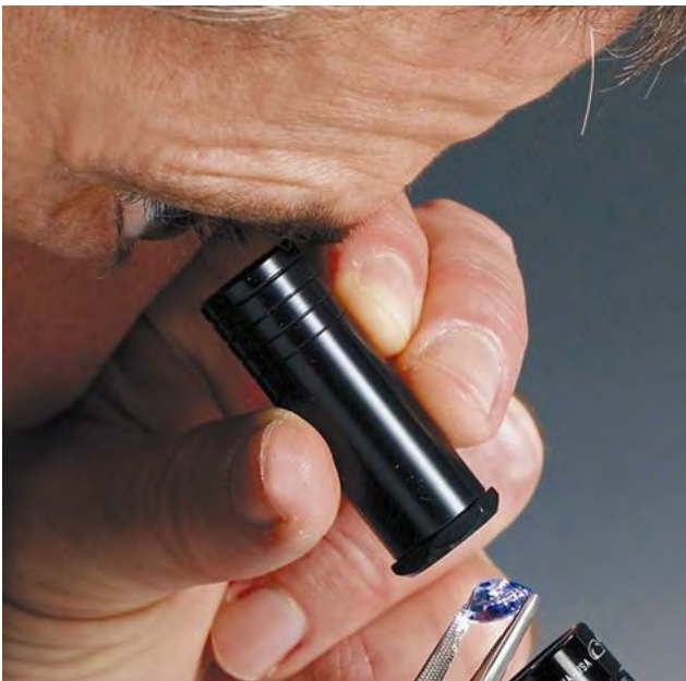
Top: Gem Identification lab student using Polariscope; Bottom: Lab student using Dicroscope