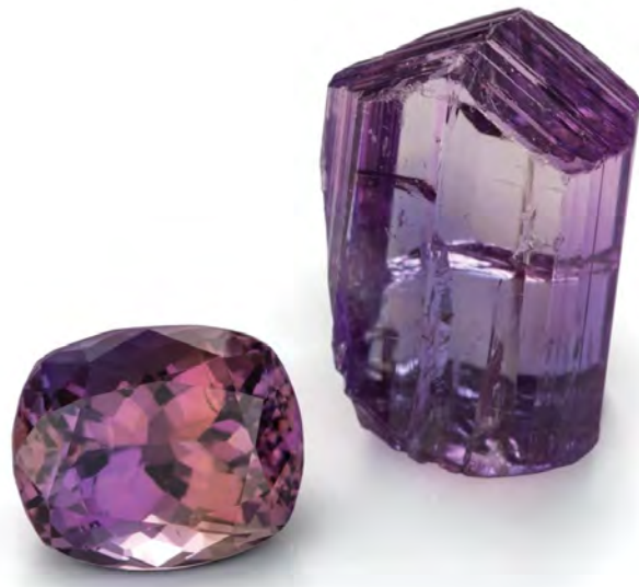
Tanzanite crystal and polished gem.

See "Class Schedules and Classroom Hours" on page 12.