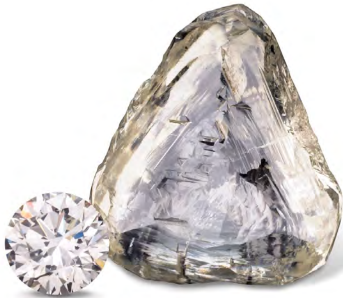
Rough and Polished diamonds

See "Class Schedules and Classroom Hours" on page 12.