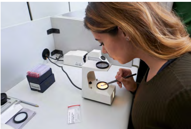
Top: Student working on online course assignments; Bottom: Student completing practical coursework in a GIA Student Workroom