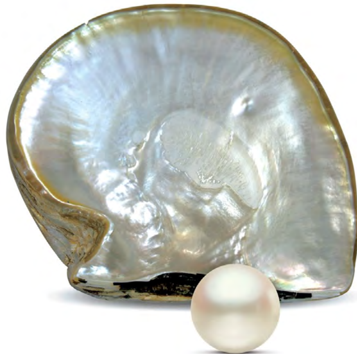
South Sea cultured pearl and mollusk

See "Class Schedules and Classroom Hours" on page 12.