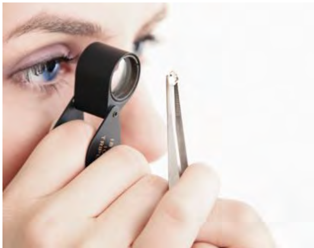
Diamond Grading Lab students assess a diamond's clarity using a 10X jeweler's loupe

* One attempt is taken during the class. Additional exam attempts are taken in a Student Workroom. Students are required to pass within three exam attempts, achieving a minimum score of 75% or higher.